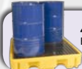
4 Drum Spillpallet BPFE4