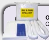
Oil & Fuel Spill Kit OSK20